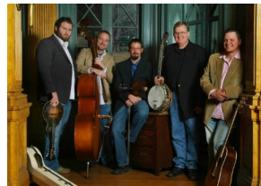
Balsam Range (Sat)