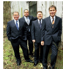
Dry Branch Fire Squad (S)