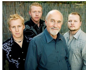
Special Consensus (Fri)